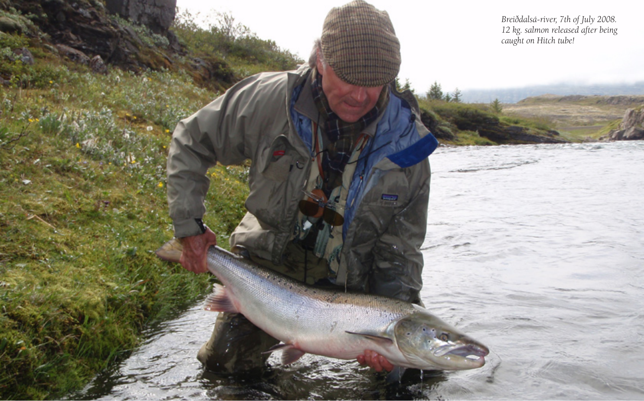
Breiðdalsá-river, 7th of July 2008. 12 kg. salmon released after being caught on Hitch tube!

Please be sure to take out personal/travel insurance before travelling to Iceland. Angling Service Strengir can not accept any responsibility for damages of any kind, loss of personal belongings, injury or death, e.g. in vehicles, in or around the lodge, or due to bad health or accident at the rivers. Nor are Angling Service Strengir responsible for the actions and liabilities of their agents, airlines, hotels, ground transportation companies or other services, other than those expressly stated in their descriptive material.