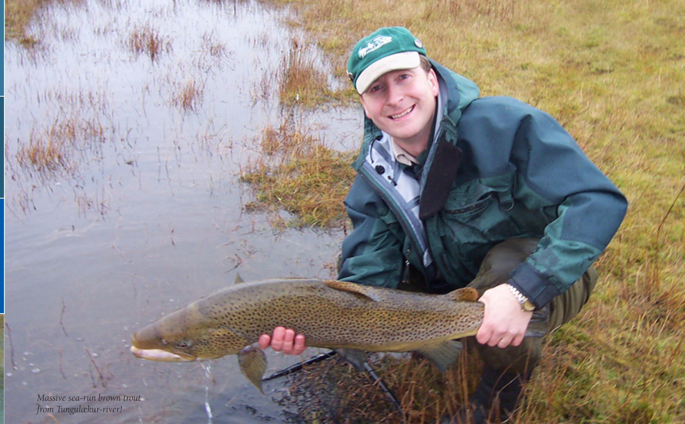
Massive sea-run brown trout from Tungulækur-river!